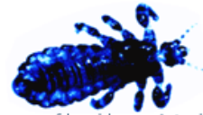
Enlarged image of head louse. Actual size 2-4mm

Head lice have been around for many thousands of years. Anyone can get head lice and given the chance head lice move from head to head without discrimination.